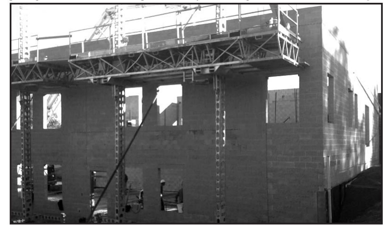
PICTURED LAST FALL is the new Apprenticeship building under construction for IBEW 317. The $1.2 million building was completed in May.