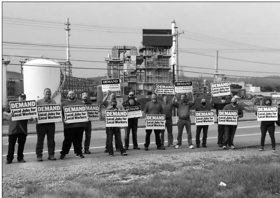
Members of Plumbers and Pipefitters Local 625, and other supporters, rally outside of the US Methanol site at Institute, WV in 2020, following the award of a piping subcontract to nonunion firm APTIM from Louisiana.